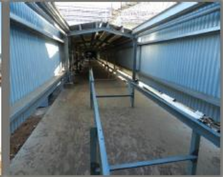
Clinker Unloading – De-Dusting